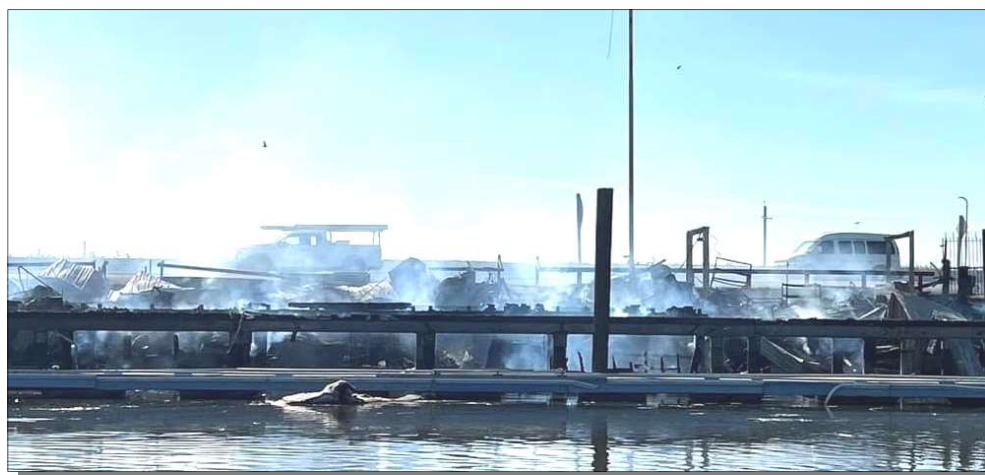
Our beloved Union Point . . . No More :(